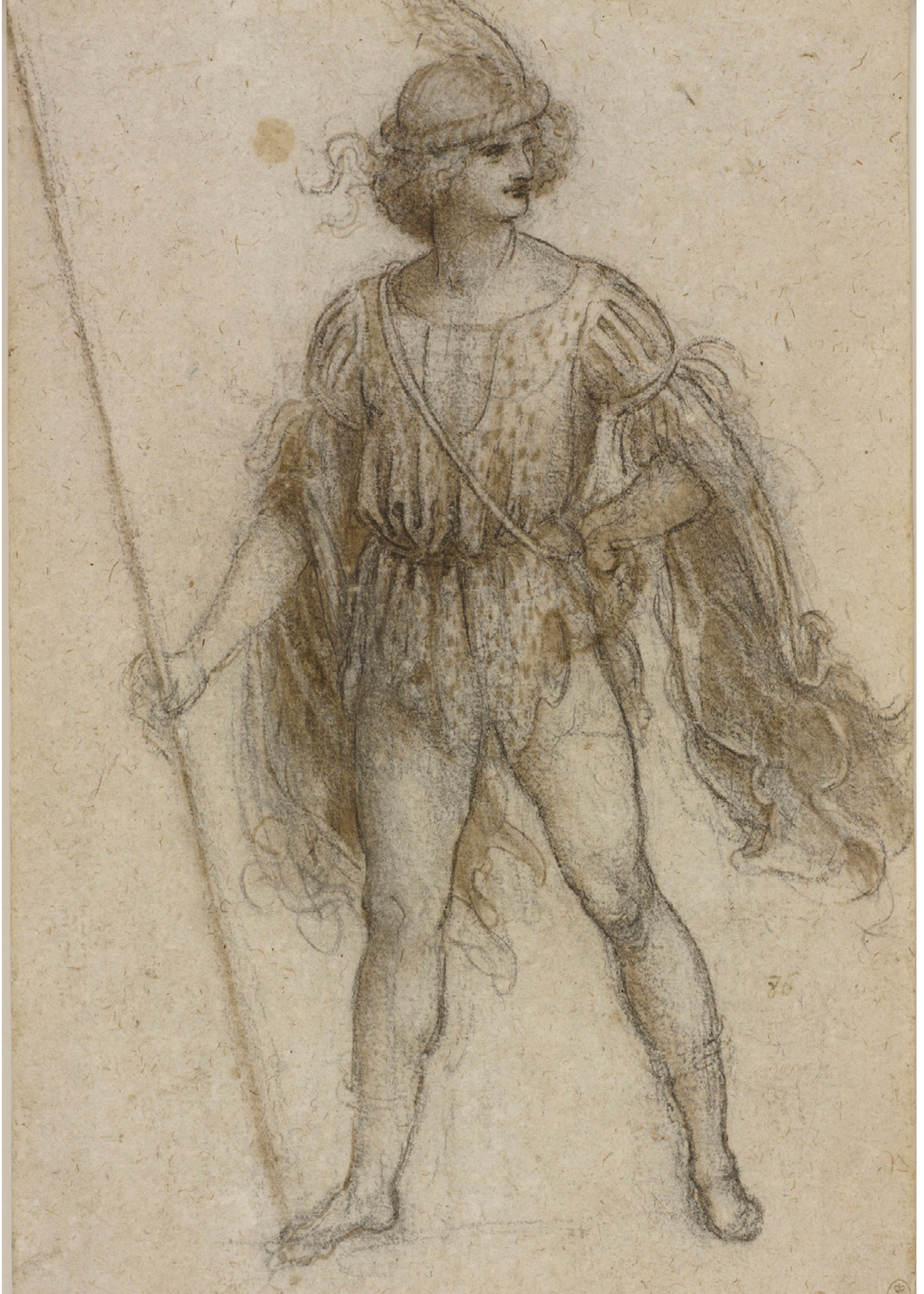
A masquerader as a lansquenet, c. 1517–18 (RCIN912575)