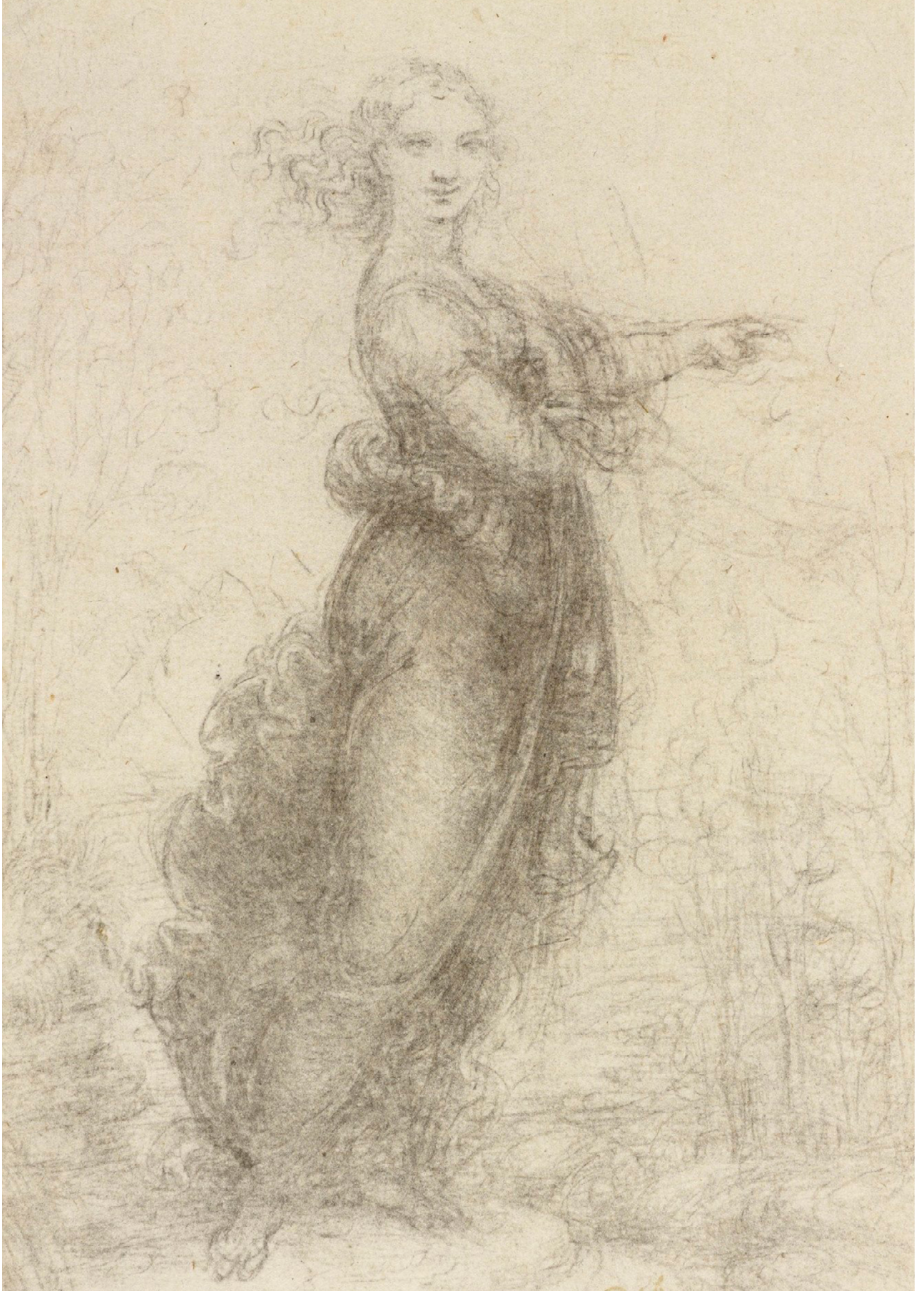
A woman in a landscape, c.1517–18 (RCIN 912581)